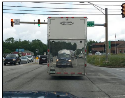
I love this picture!