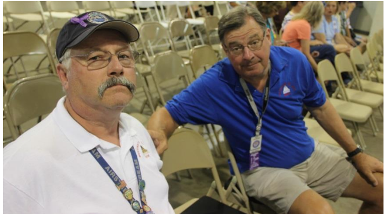
Not too sure about these two!