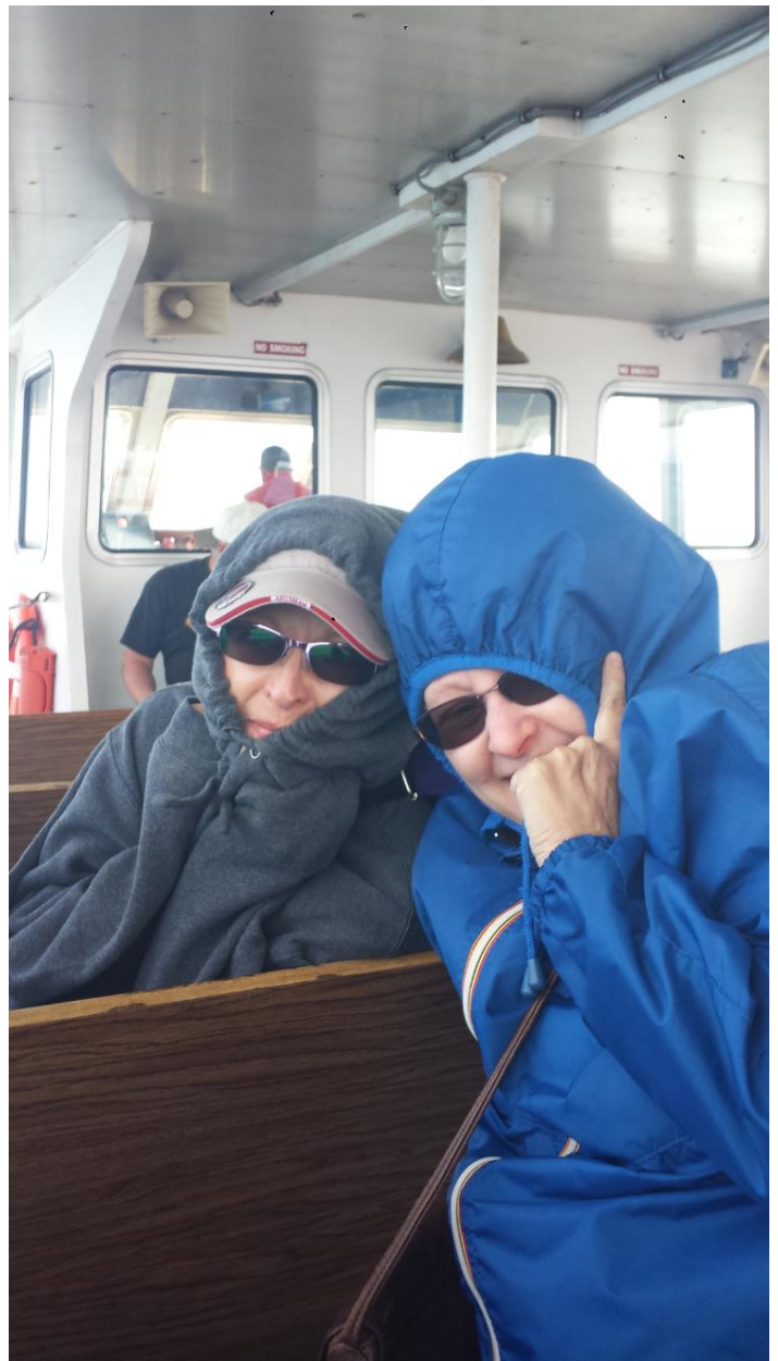
SUPER WINDY DAY