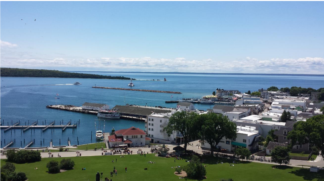
BEAUTIFUL MACKINAC ISLAND