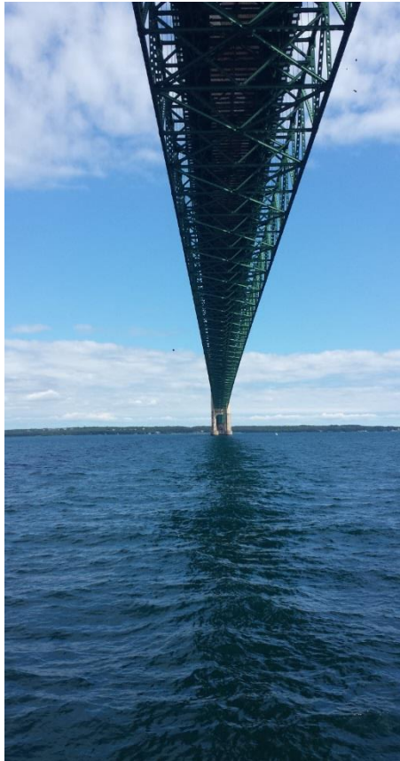
THE MIGHTY MACK