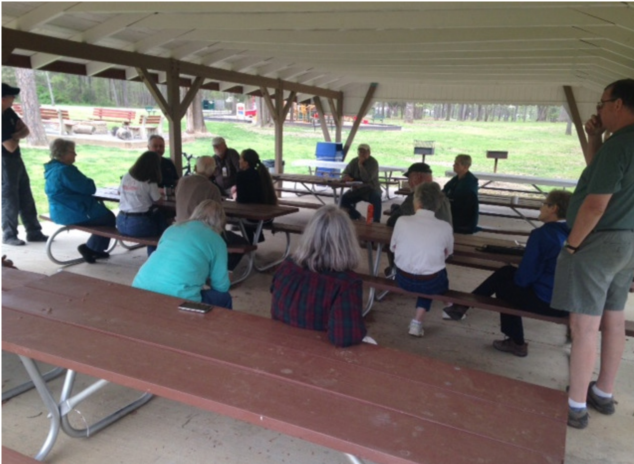
Sharing maintenance ideas.

It was a wonderful weekend and I can't wait to get together again.